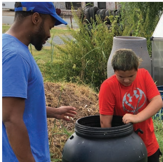
Garden workday for the CIS Youth Garden, Community Restitution program