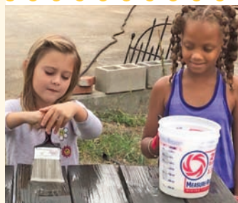
Thank you to Chatham Serves from Chatham Community Church for their service in the CIS Youth Garden. Young volunteers hard at work!